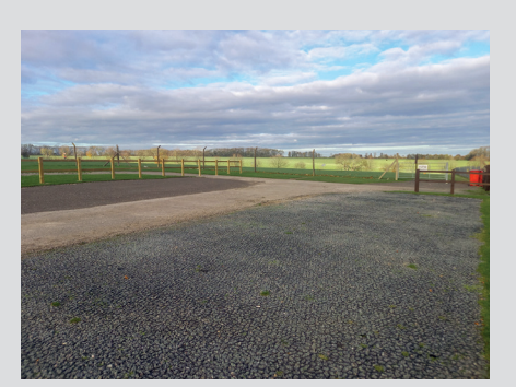
Visitors' Car Park

Please see map on reverse for entry and parking locations.