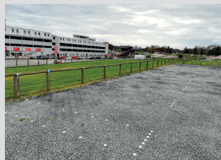
Hard surface parking within venue

Please note: At Grade D (smaller, club-level) events ALL parking is accessible through the main entrance only. For a list of Grade D events please visit www.msv.com .