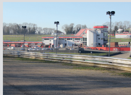
Southbank parking area

Please see map on reverse for entry and parking locations.